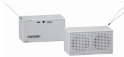
TF-Y06 Bluetooth Speaker Product User manual Version: V1.0

Please read this product manual carefully before using the product. In the use of any problems, you can contact the local sales shop. Replacement service: During the replacement period (within seven days from the date of purchase of the product), it appears in normal use If the fault is not caused by human, please keep the outer integrity of the product accessories packaging (or appearance damage) for warranty Deal with). After the inspection confirms the fault, you can choose to replace or repair. Warranty service: During the warranty period, if there is a non-human fault in normal use, you can enjoy free Warranty, Warranty service (free warranty within one year, if man-made damage, for charging maintenance treatment).