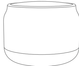
TF-Y01 BT speaker Instruction manual