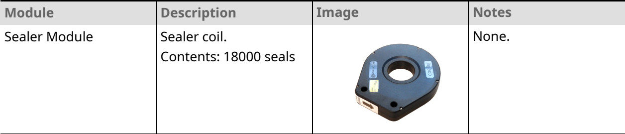
Table 282: Consumables

Refer to the section about Analyzers/Custom Modules for the possible list of consumables addressed to the specific Analyzers/Custom Modules.