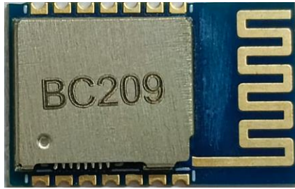
Fig. 1: Image of BC209