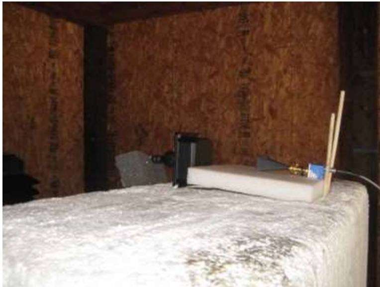
Test Setup; View 2