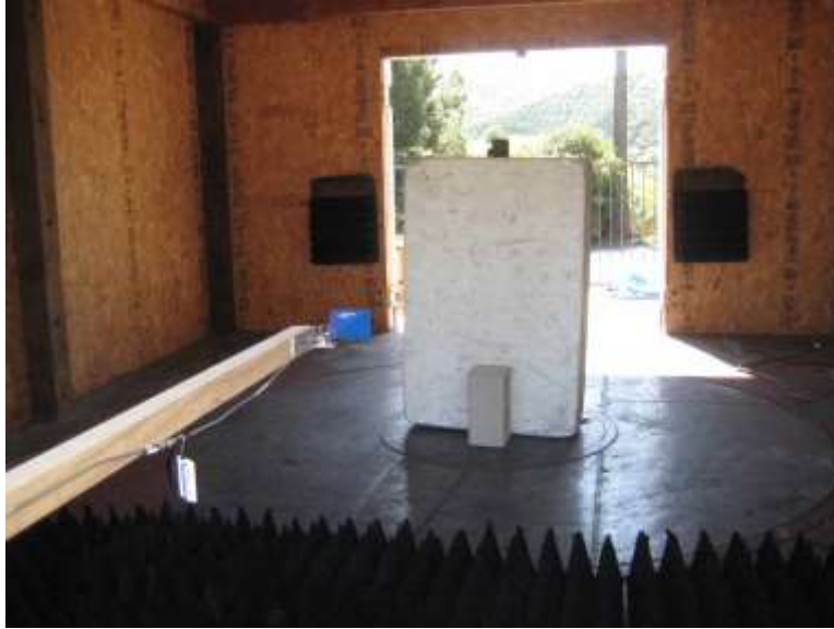
Test Setup; View 1