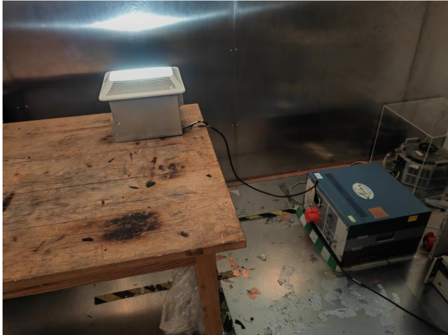
RF conducted test: