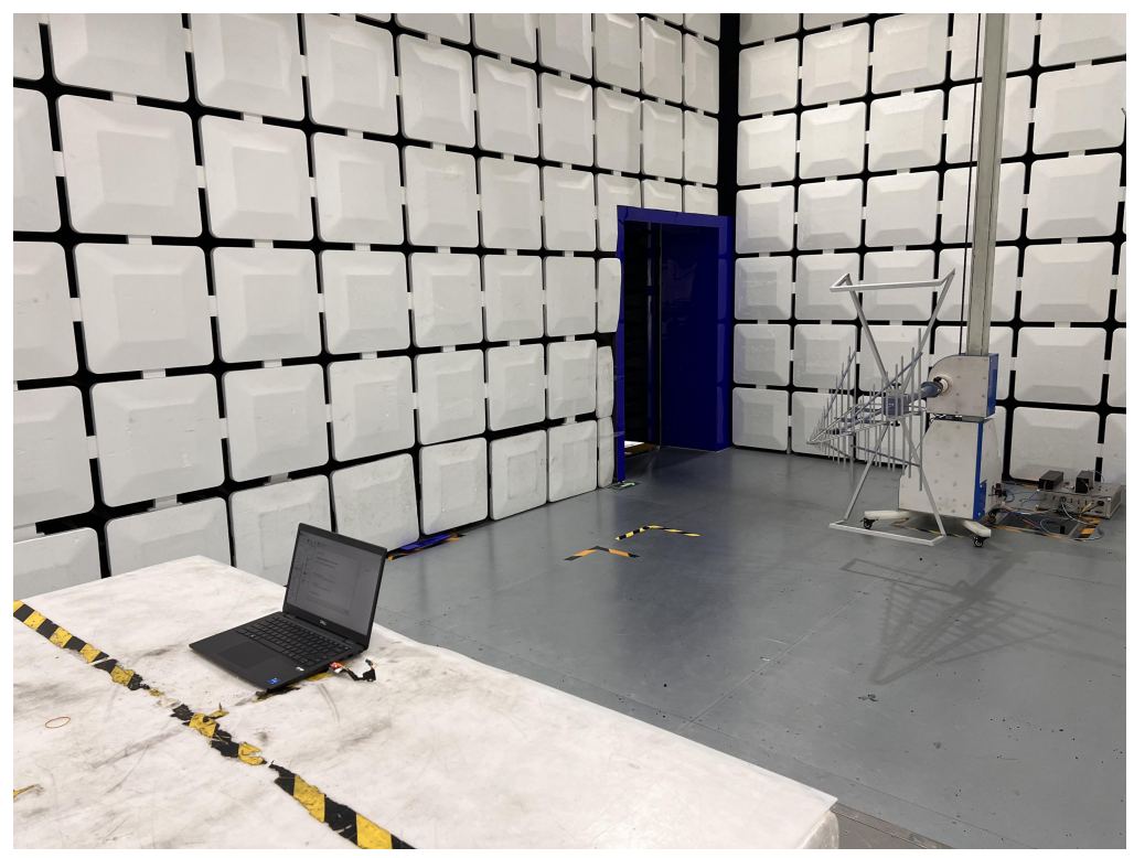
Description: Radiated Emission Test Setup for Above 1GHz