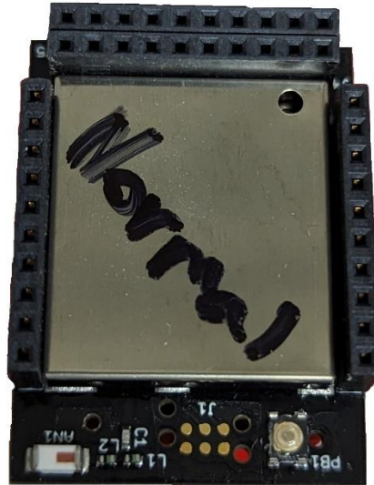
Figure 1: EUT

The information provided in this section is for the Equipment Under Test (EUT) and the corresponding Auxiliary Equipment needed to perform the tests as a complete system.