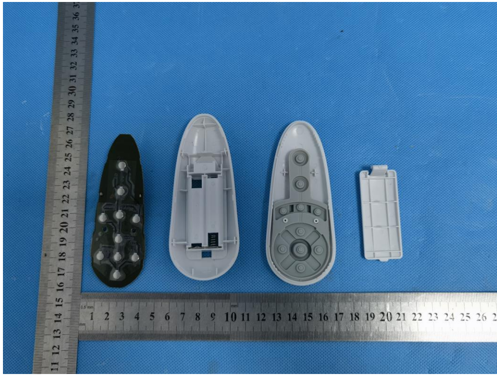
INTERNAL VIEW OF EUT (FIGURE 1)