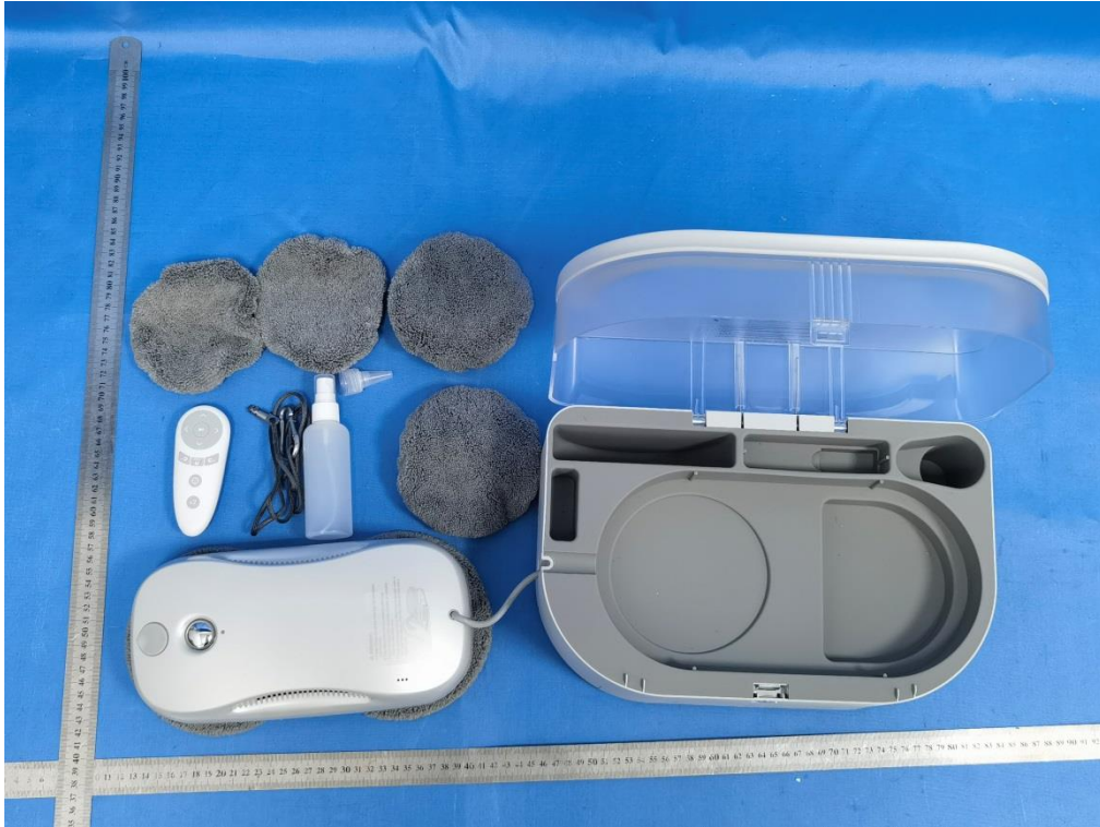
Window Cleaning Robot TOP VIEW OF EU