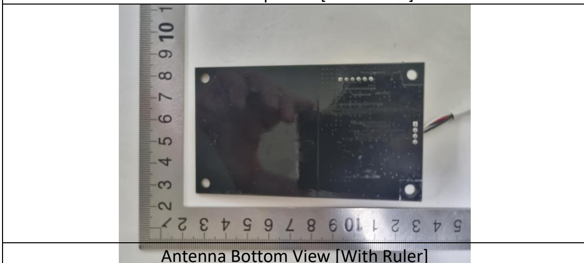
Antenna Bottom View [With Ruler]