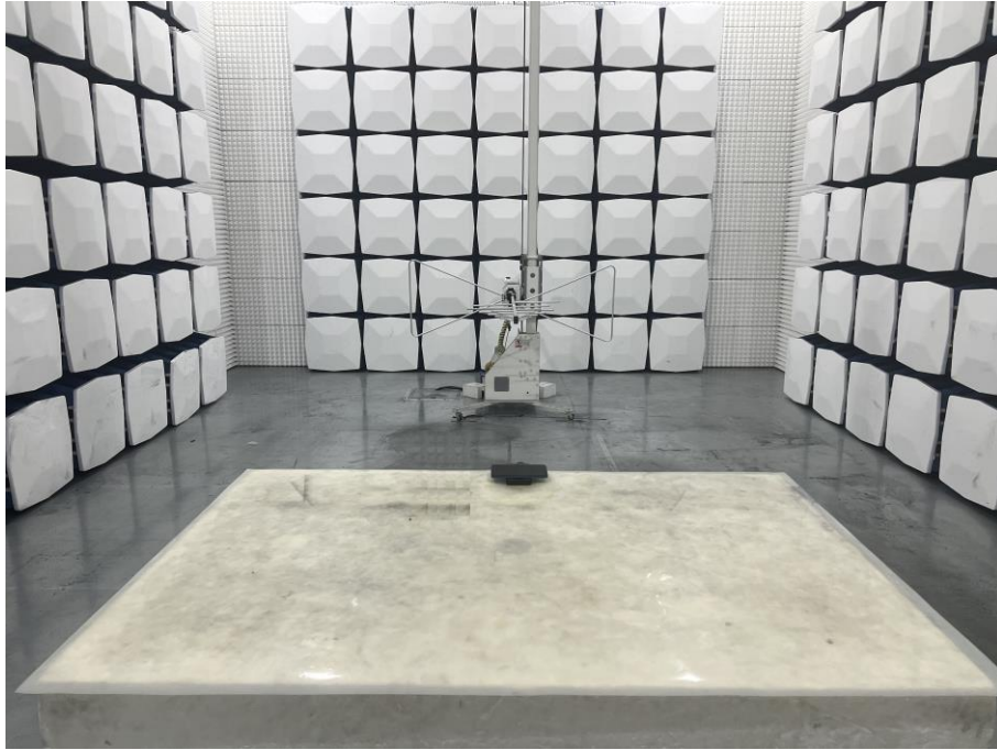
Radiated Measurement Photos