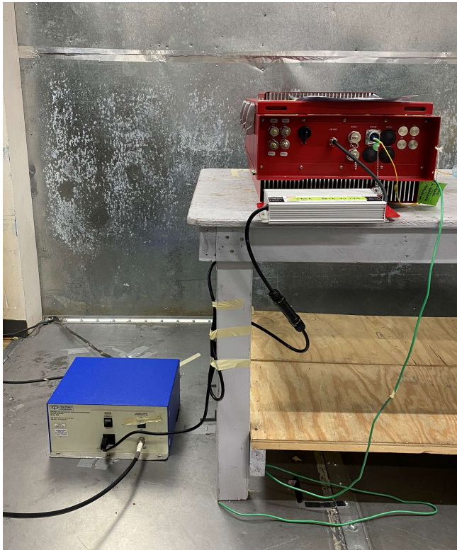
Figure 2: Radiated Emissions (Below 1GHz) Emissions Test Setup