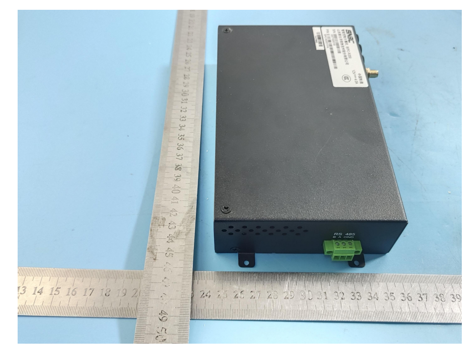
LEFT VIEW OF SAMPLE