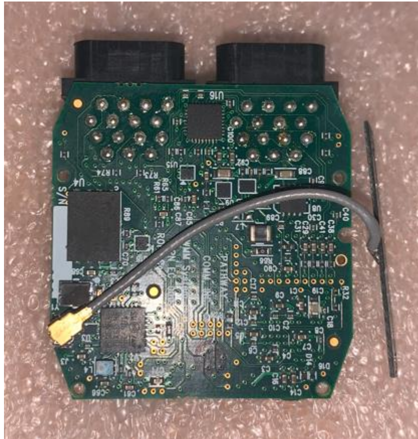
Figure 3 – PCB, Bottom view