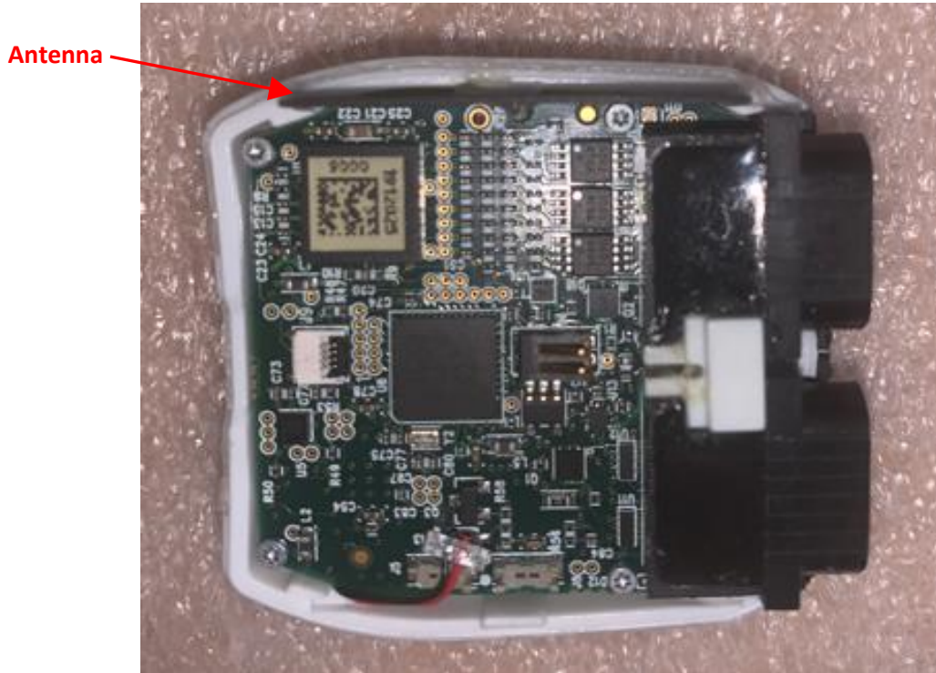
Figure 1 – PCB close-up, Top view