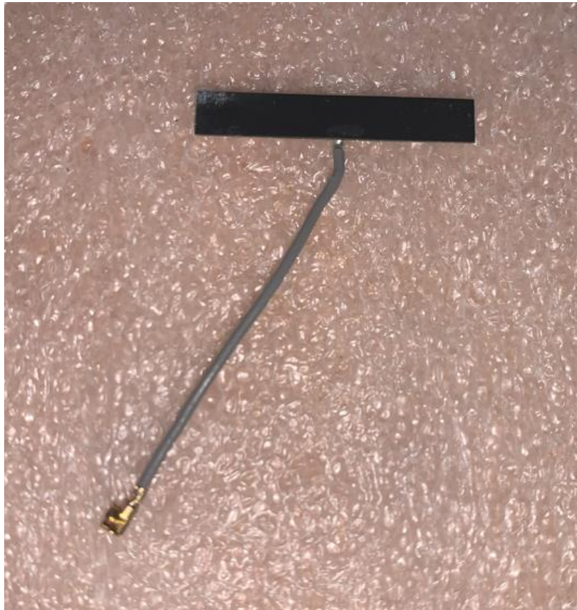
Figure 5 – Antenna, Bottom view