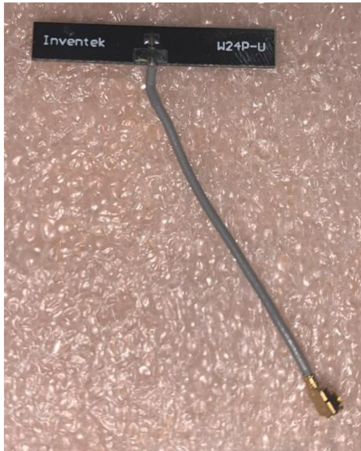
Figure 4 – Antenna, Top view