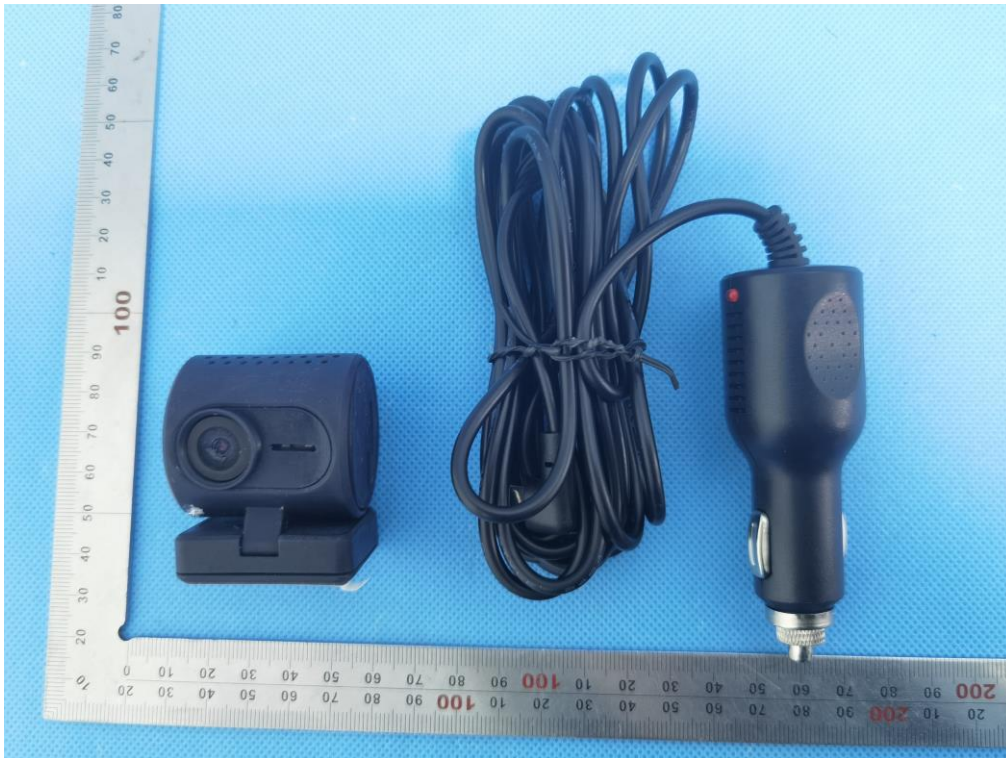
VIEW OF CAR CHARFER