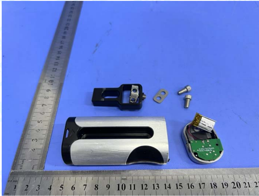
Photo 6 Appearance of PCB