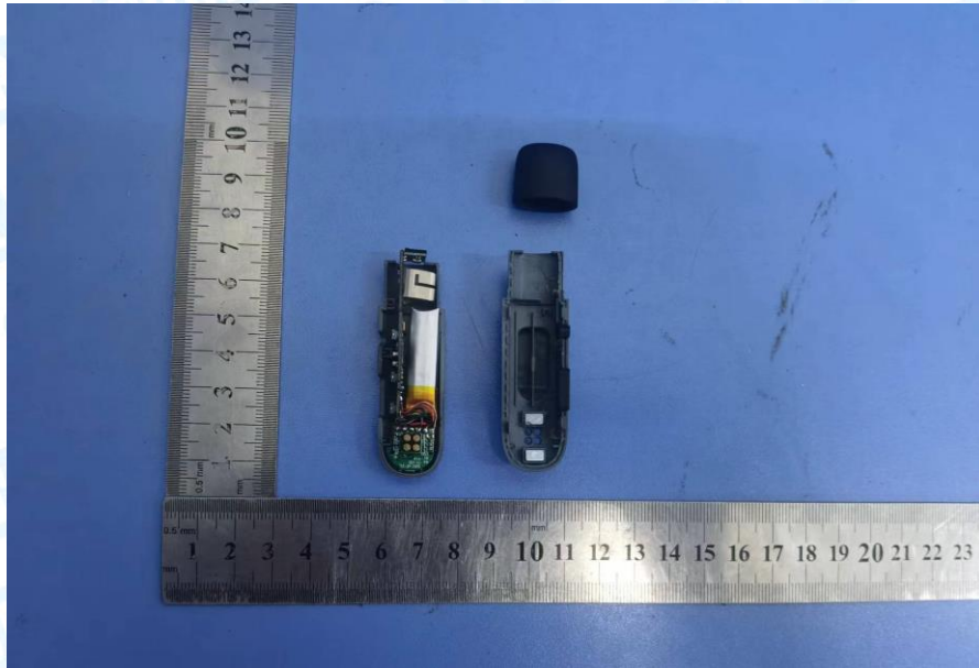
Photo 10 Appearance of PCB