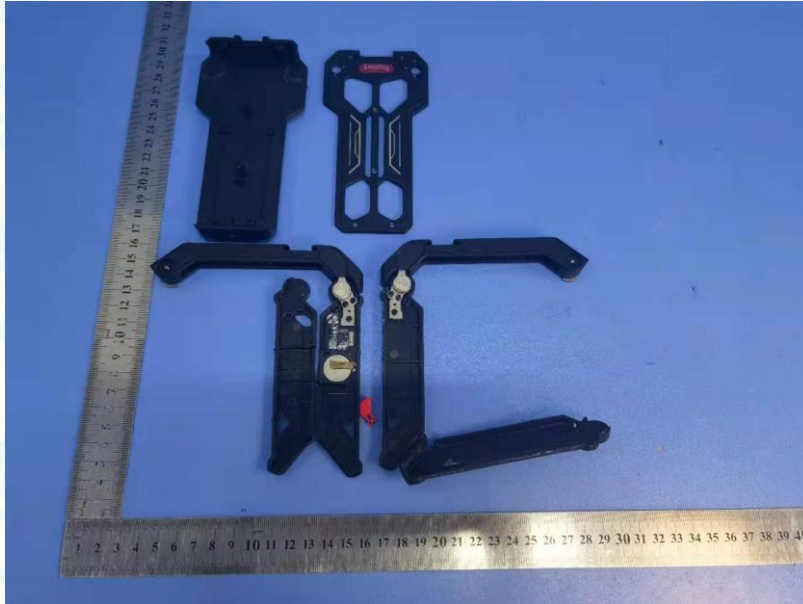
Photo 8 Appearance of PCB