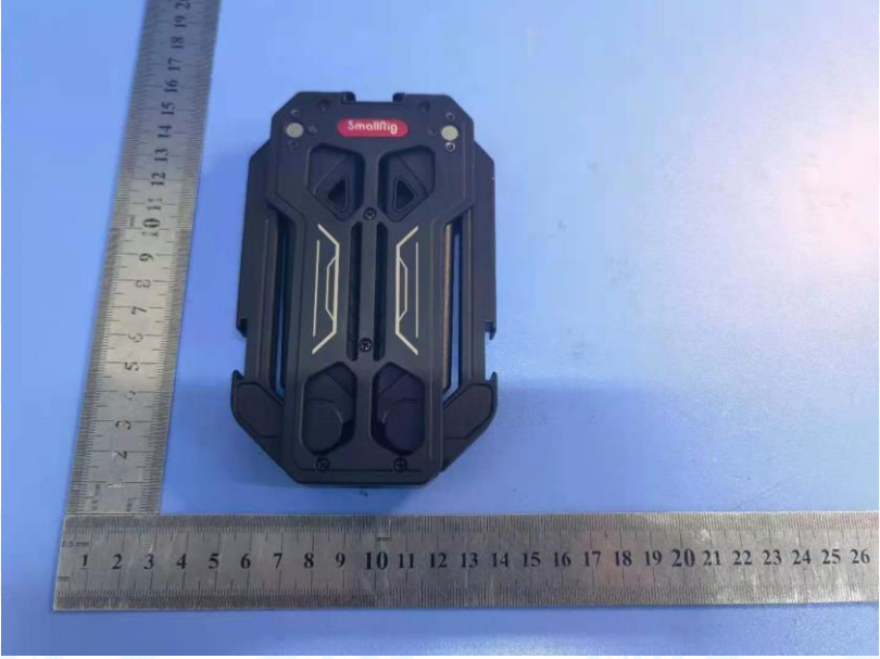
Photo 2 Appearance of EUT