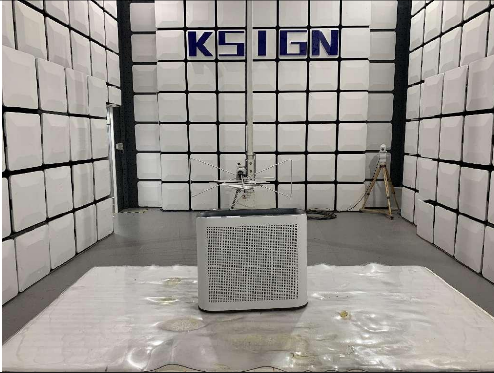
Radiated Measurement (Above 1GHz)