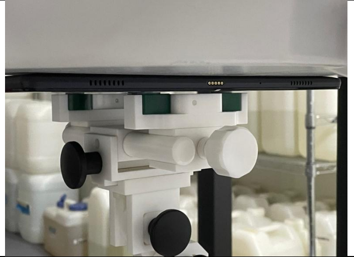
Back Side (Separation distance of 0mm)