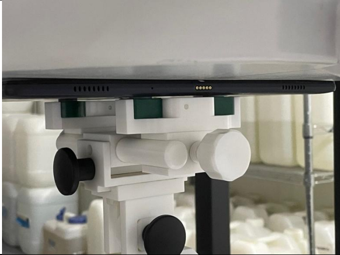
Front Side (Separation distance of 0mm)