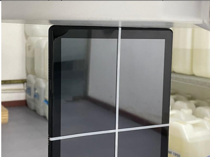
Left side (Separation distance of 0mm)