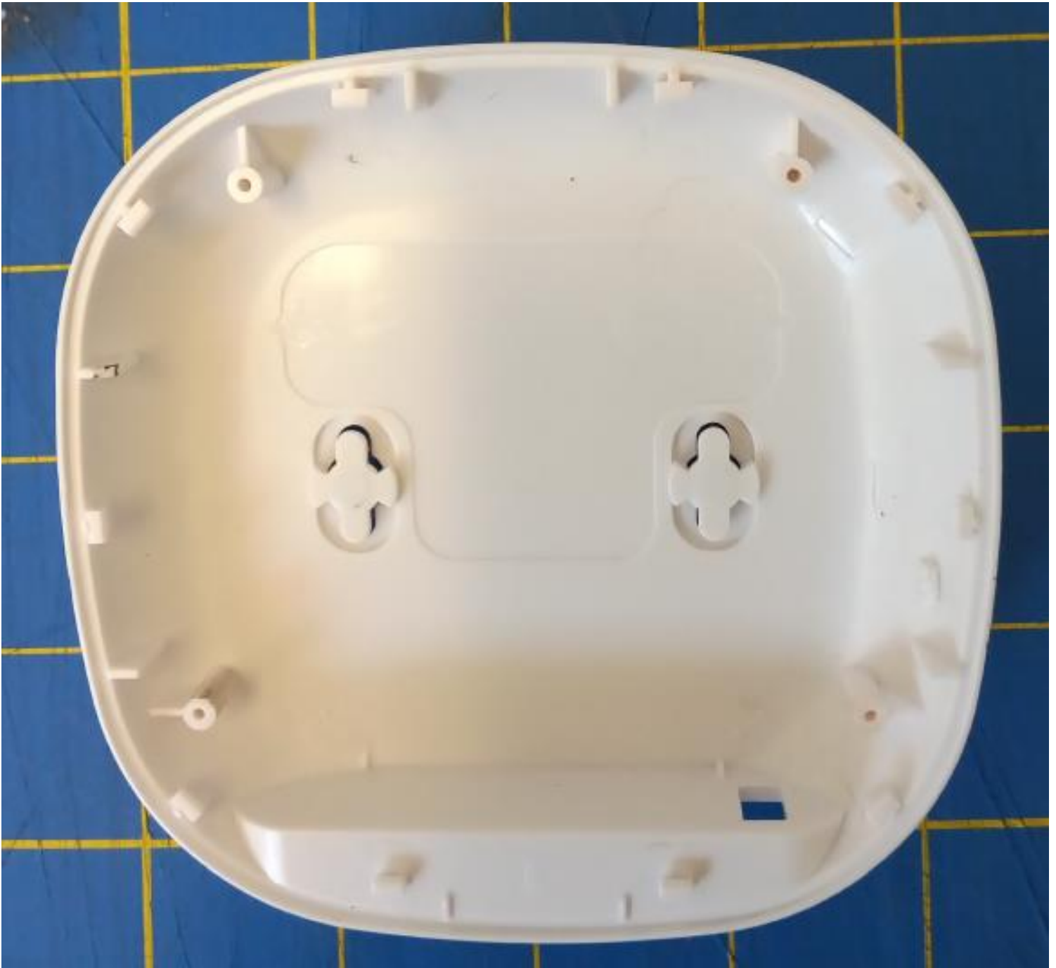
PCB Placement in Enclosure (enclosure without PCB)