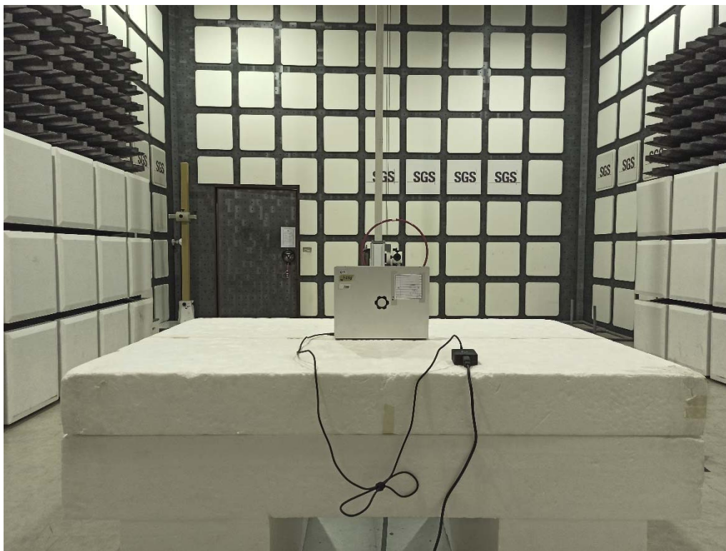
Radiated Emission Set up Photos (Below 1GHz)