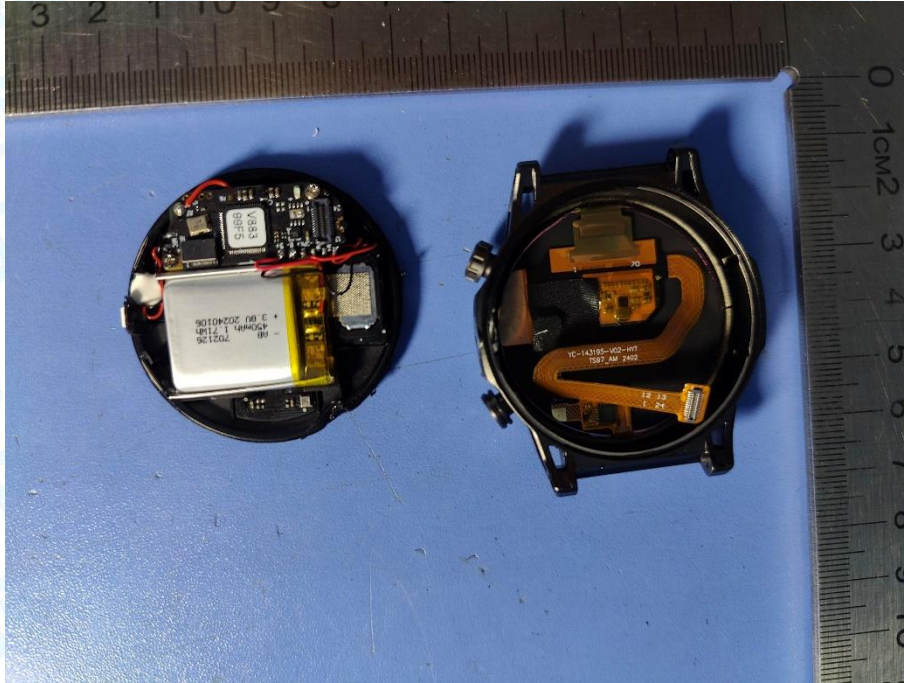
Photo 8 Battery appearance