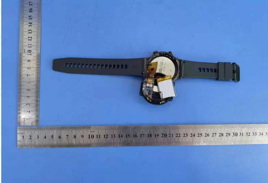
Photo 6 Appearance of PCB