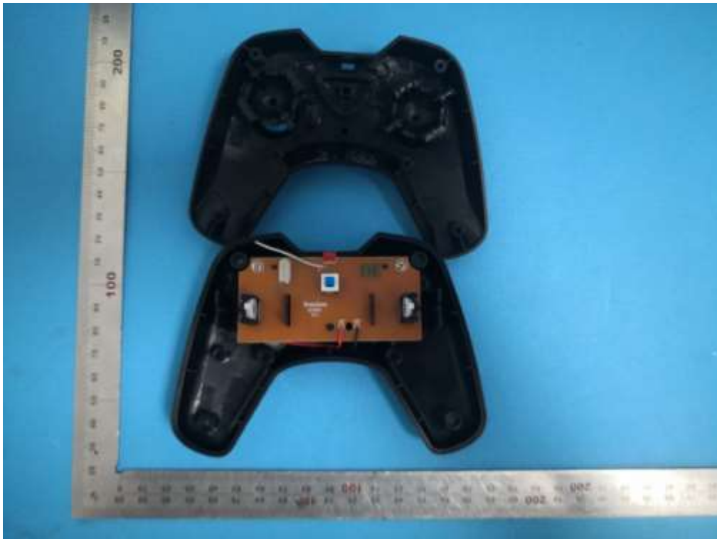
INTERNAL VIEW OF EUT (FIGURE 1)