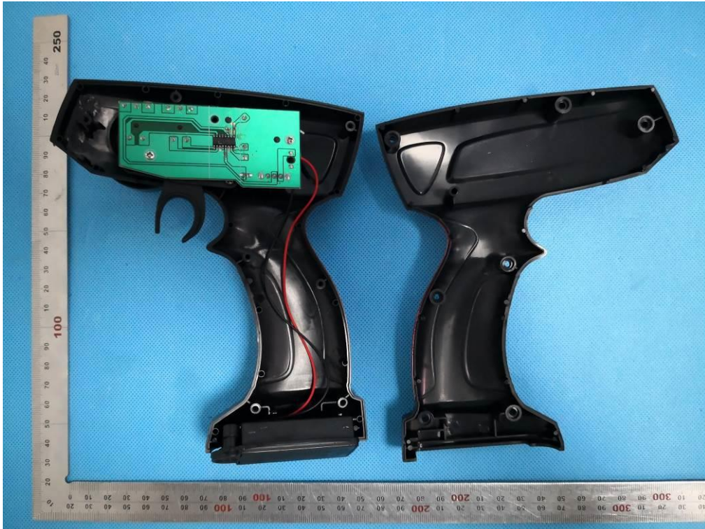
INTERNAL VIEW OF EUT (FIGURE 1)