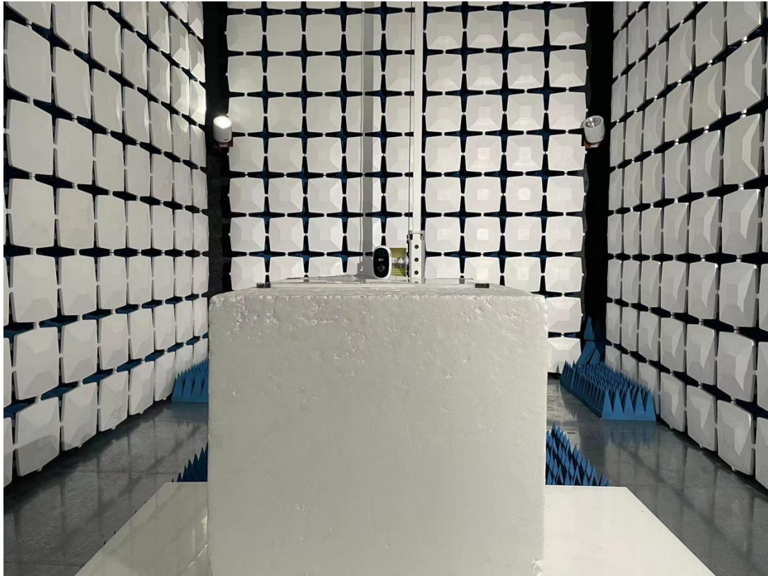
Conducted emission test setup