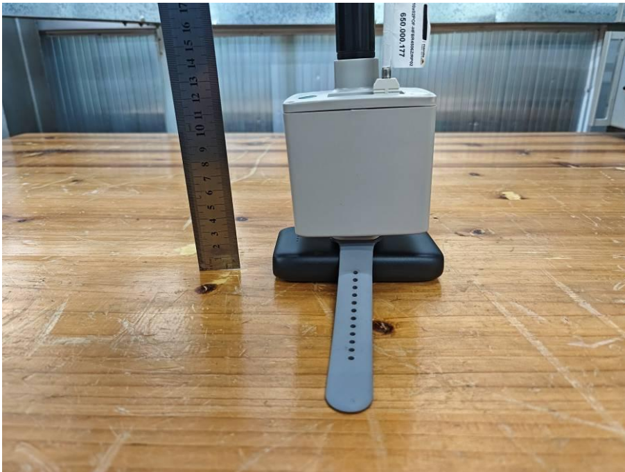
Test Position F-0cm from the edge of EUT to the geometric center of the probe