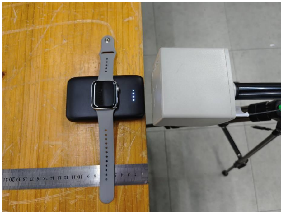
Test Position B-0cm from the edge of EUT to the geometric center of the probe