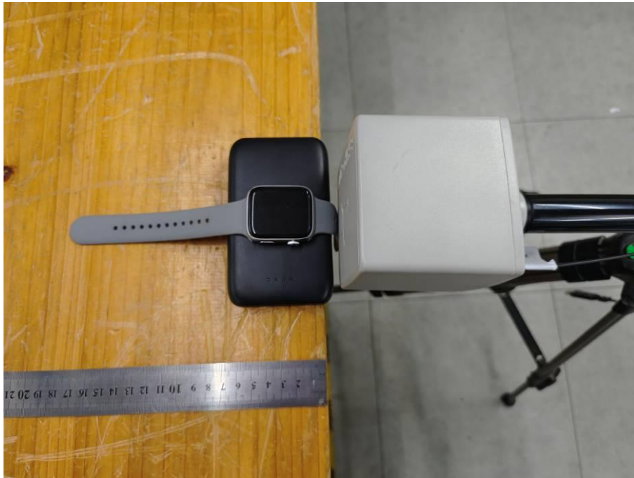
Test Position A-0cm from the edge of EUT to the geometric center of the probe