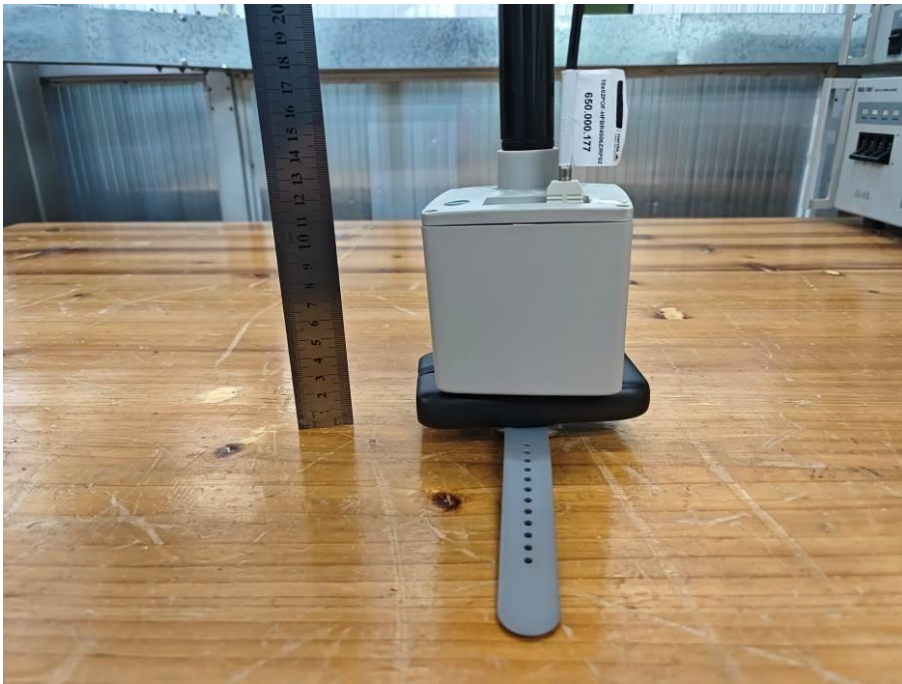
Test Position E-0cm from the edge of EUT to the geometric center of the probe