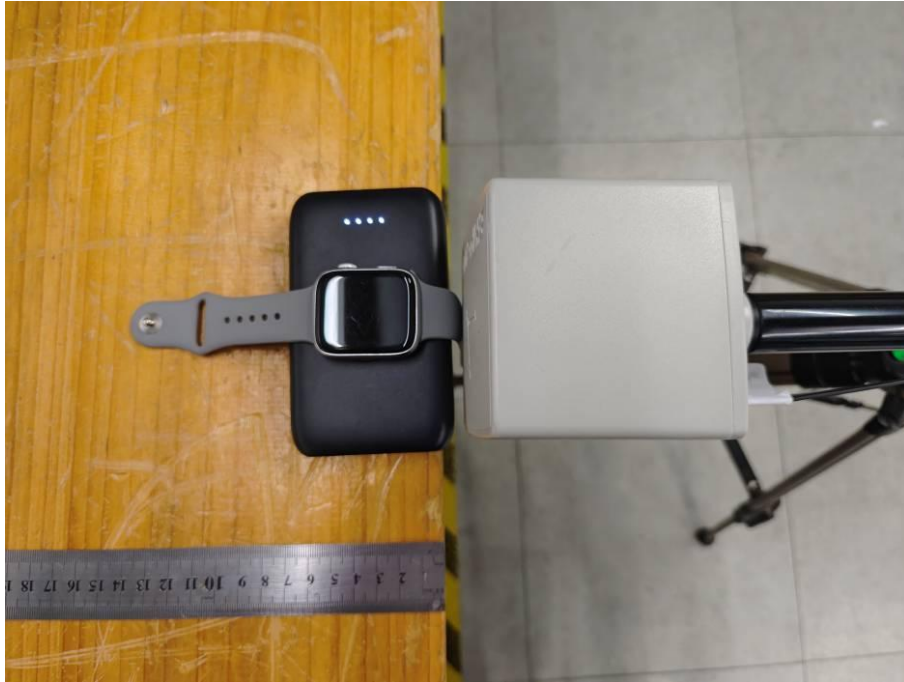
Test Position C-0cm from the edge of EUT to the geometric center of the probe