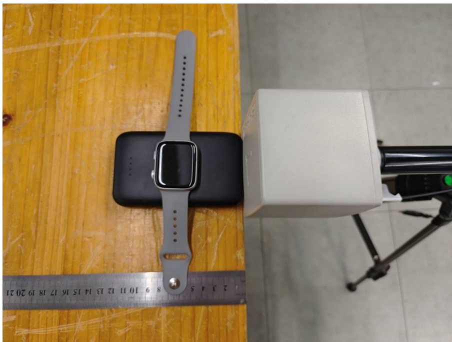
Test Position D-0cm from the edge of EUT to the geometric center of the probe