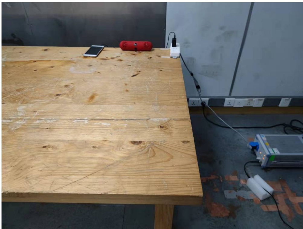
Photo of Conducted Emission Measurement