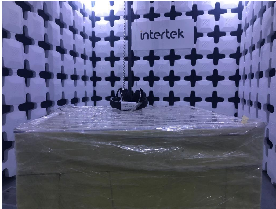
Back View (Above 1GHz)