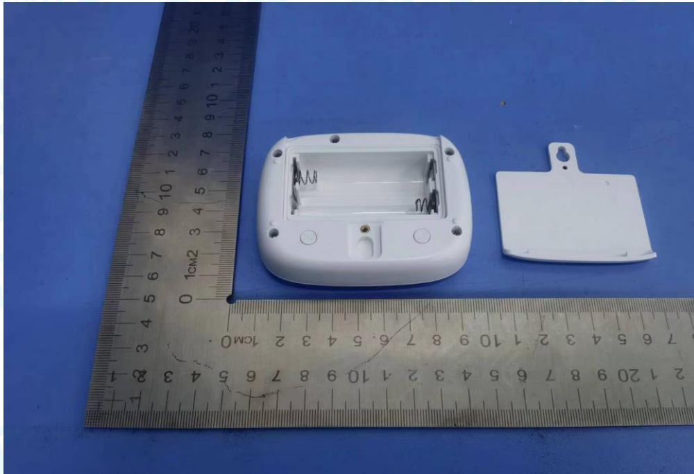
Photo 7 Internal of EUT