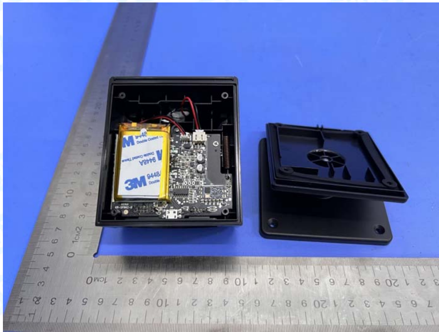
Photo 7 Internal of EUT