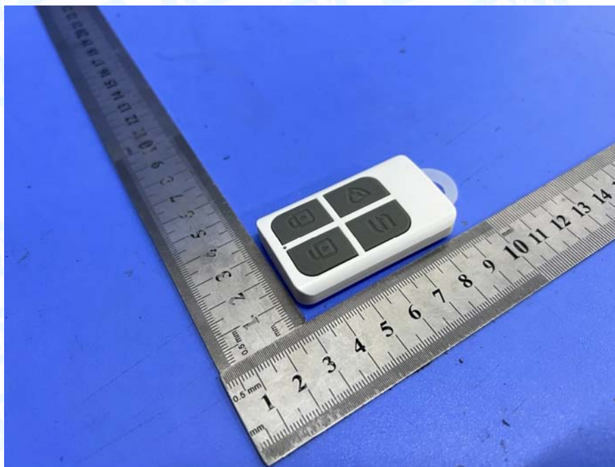
Photo 2 Appearance of EUT