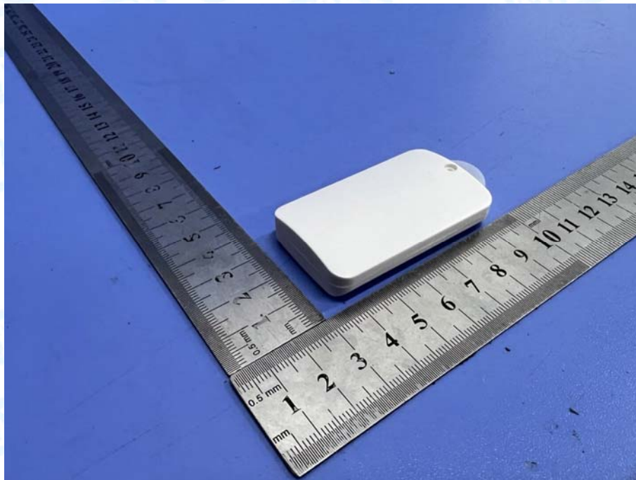
Photo 4 Appearance of EUT