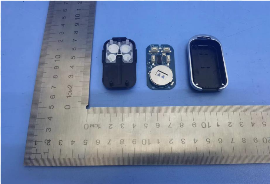
Photo 8 Appearance of PCB