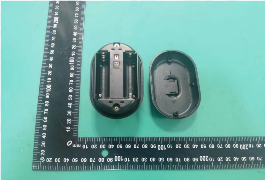
Photo 8 Internal of EUT