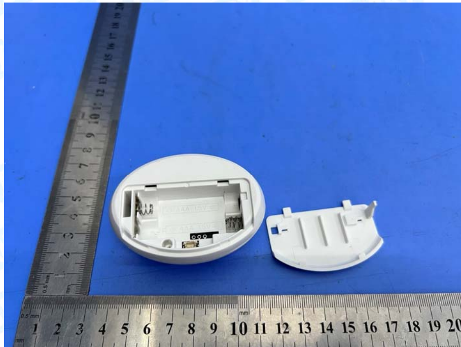
Photo 6 Internal of EUT