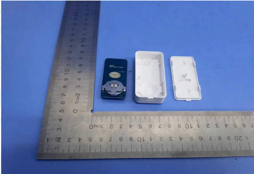
Photo 8 Appearance of PCB