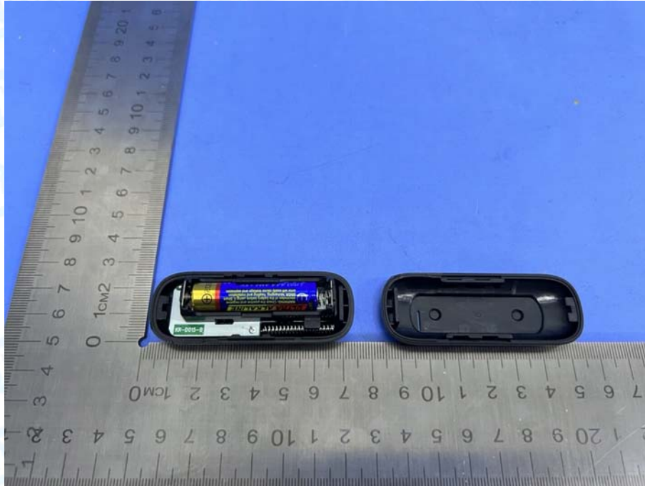
Photo 4 Internal of PCB