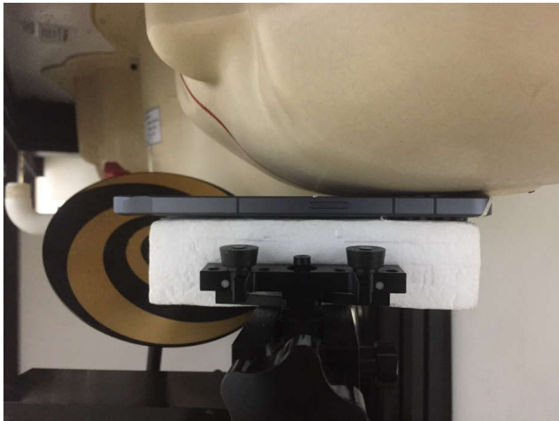
Left Cheek (0mm)