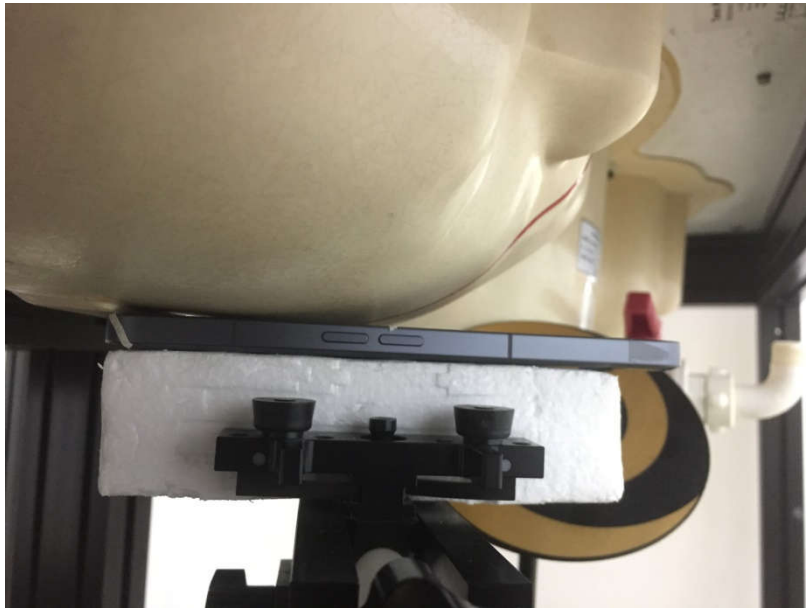
Right Cheek (0mm)