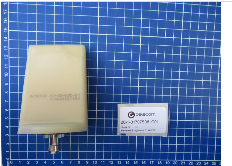
Photograph 3: AE 1_Front side view