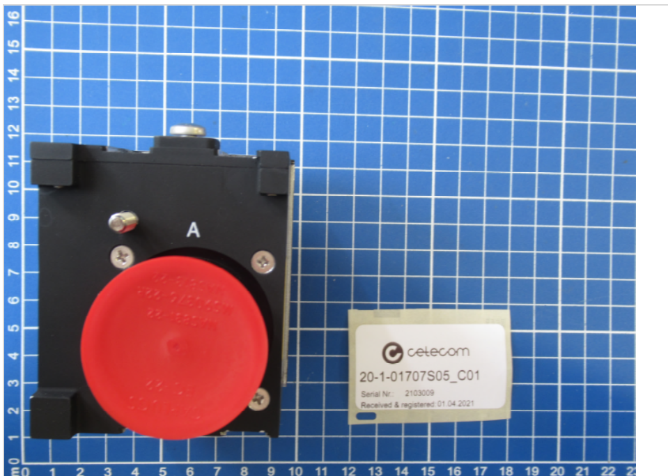
Photograph 2: EUT 1_Rear side view