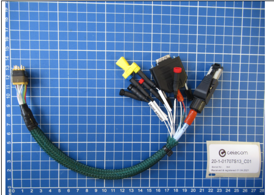
Photograph 5: CAB 1_Front side view