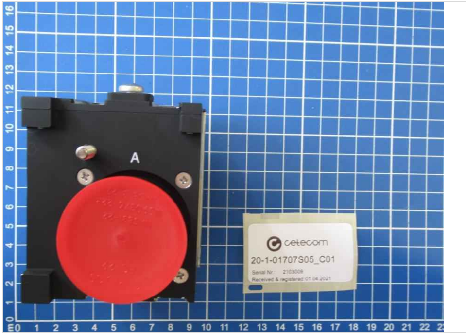
Photograph 5: EUT 1_Right side view