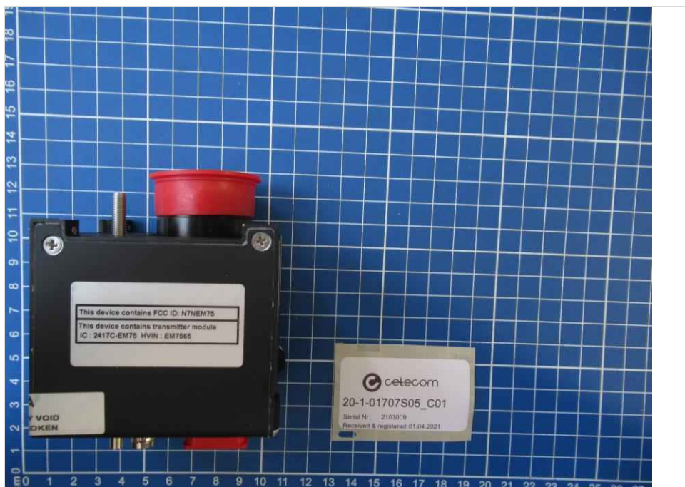
Photograph 2: EUT 1_Bottom side view