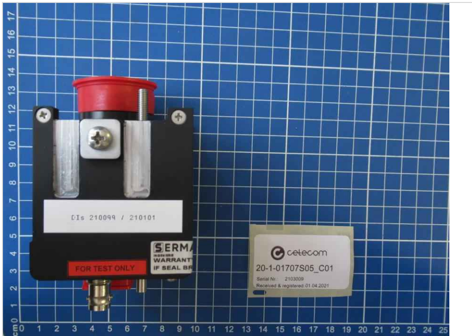
Photograph 4: EUT 1_Rear side view