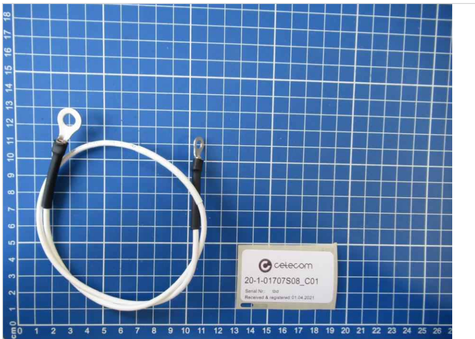
Photograph 4: CAB 01