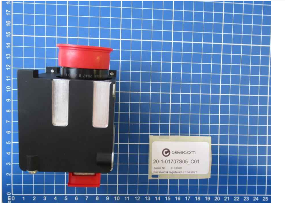
Photograph 3: EUT 1_Front side view