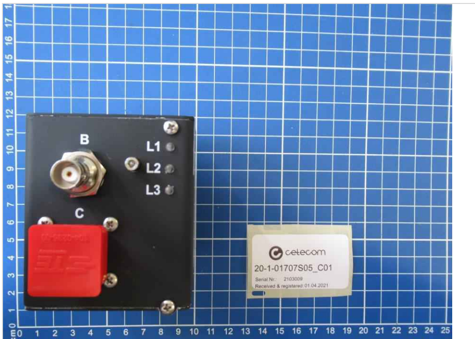
Photograph 6: EUT 1_Left side view