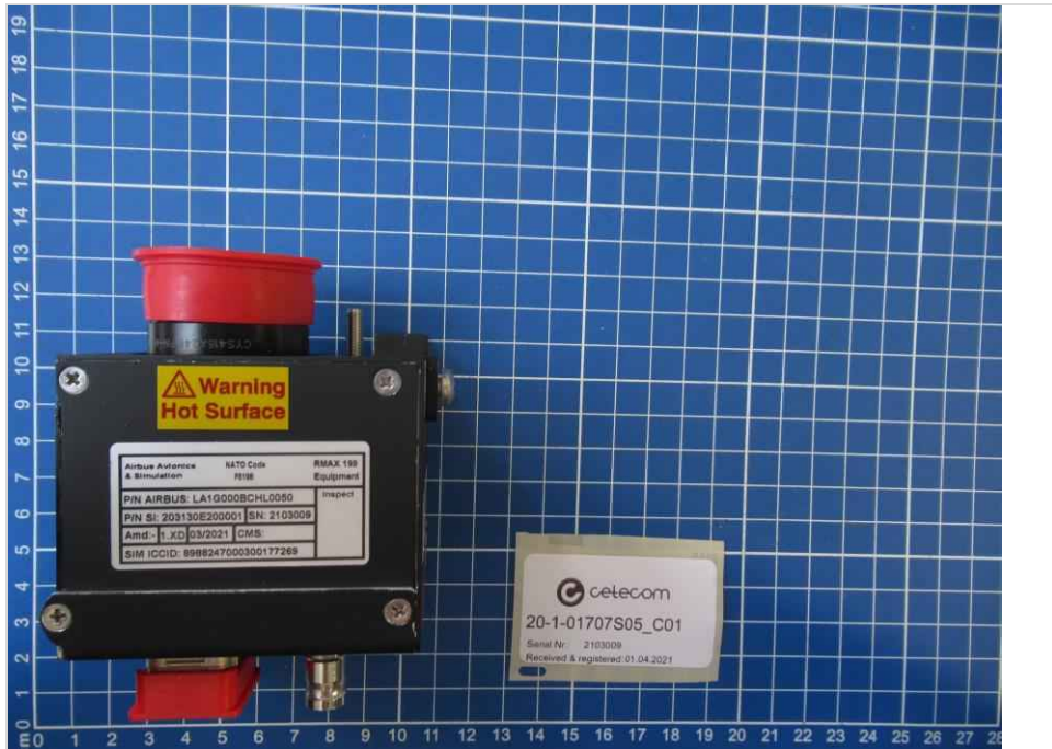
Photograph 1: EUT 1_Top side view