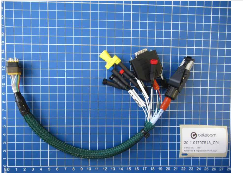
Photograph 5: CAB 02