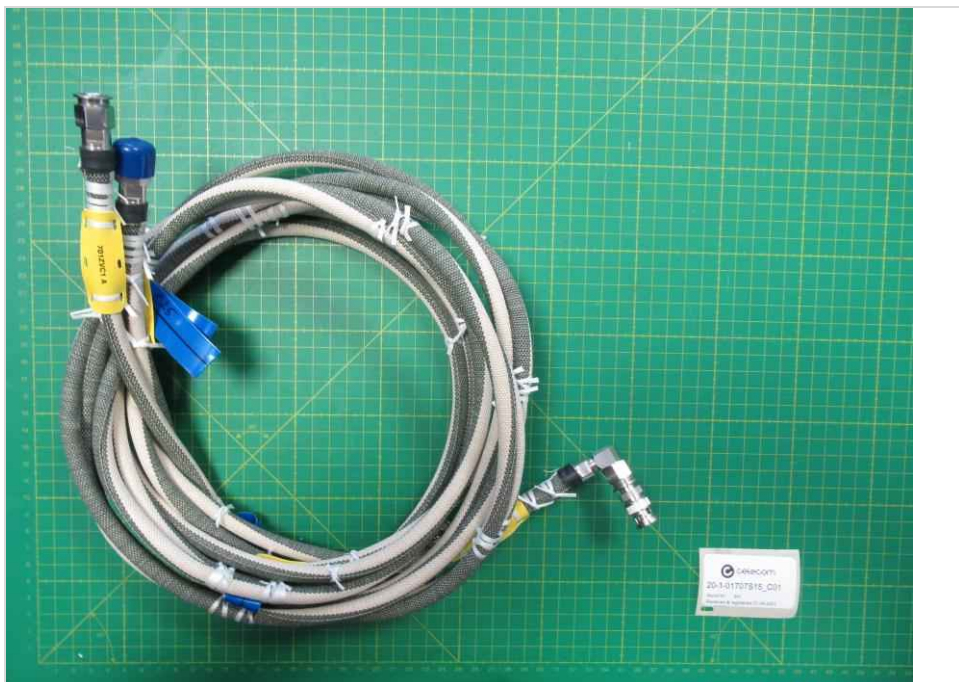
Photograph 6: CAB 03