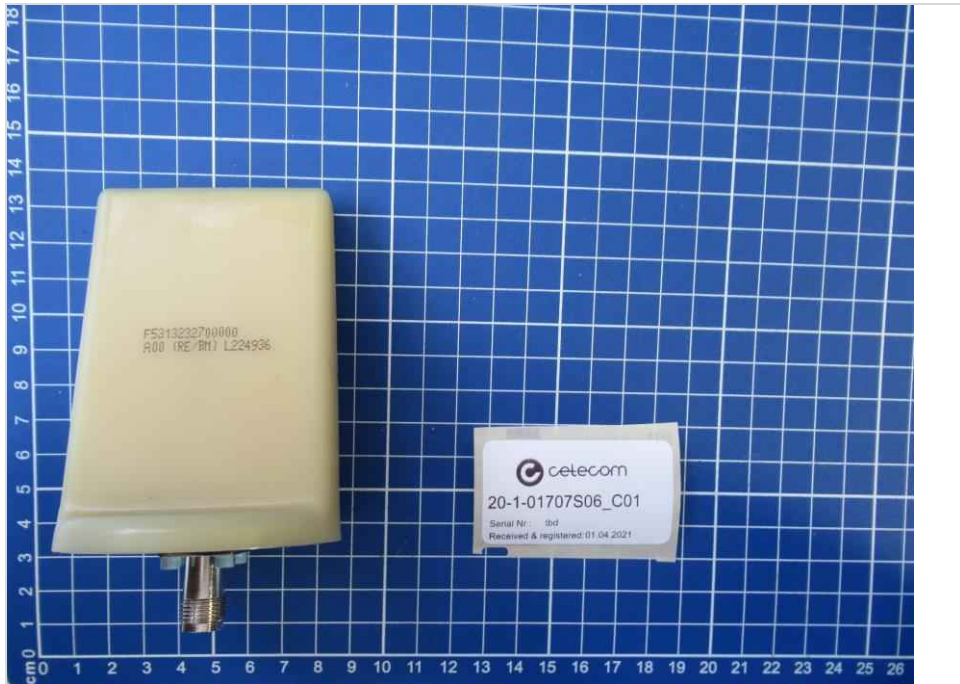
Photograph 1: AE 01