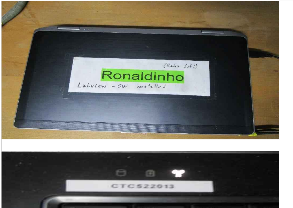
Photograph 3: AE 03