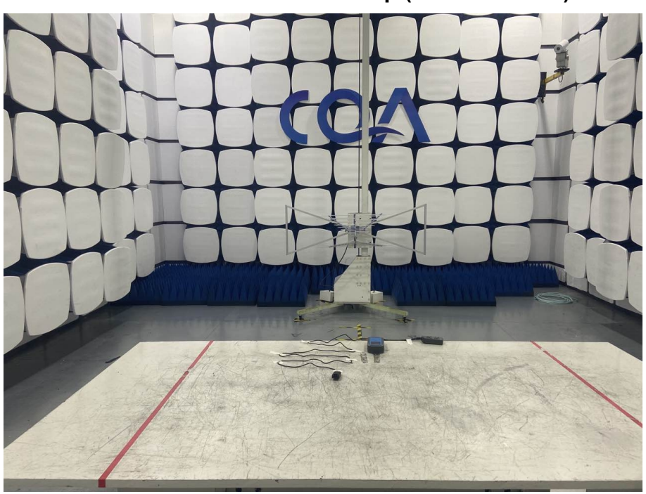
Radiated emission Test Setup (30MHz~1GHz)