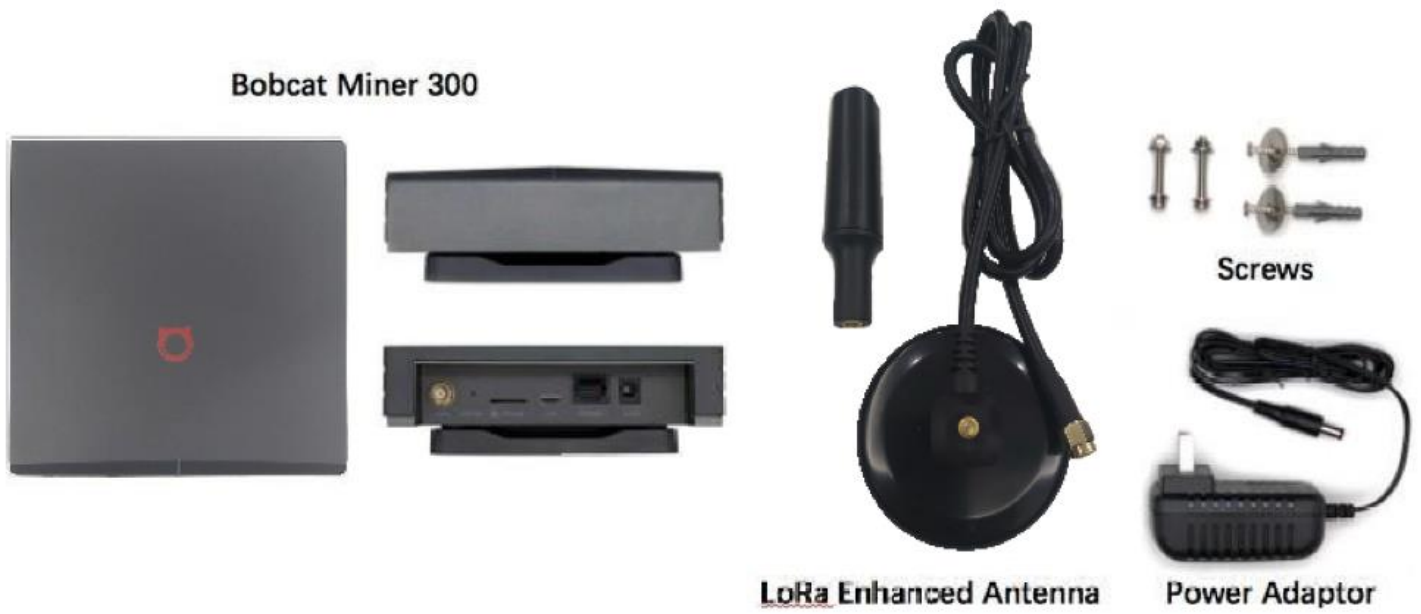
Bobcat Miner 300