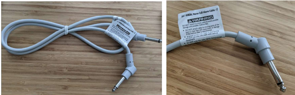
Figure 2. Images of 8282SL SKU – representative equivalent product

A complaint review was evaluated for the calendar period from 2013 to 2021 and there are no complaints related to the warning label being removed, falling off, or becoming illegible.