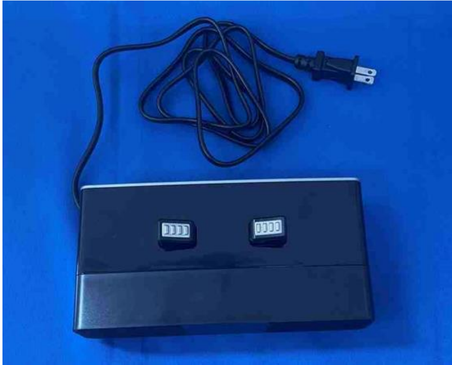
The alternative docking station CH2118