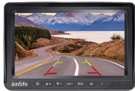
Turn on guide lines