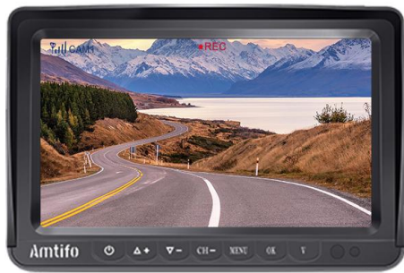
Turn off guide lines