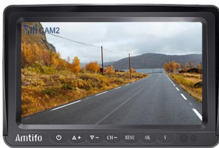
Single full Screen

This monitor supports adding 1 to 4 cameras