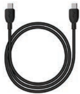
USB-C to USB-C Cable (1m)