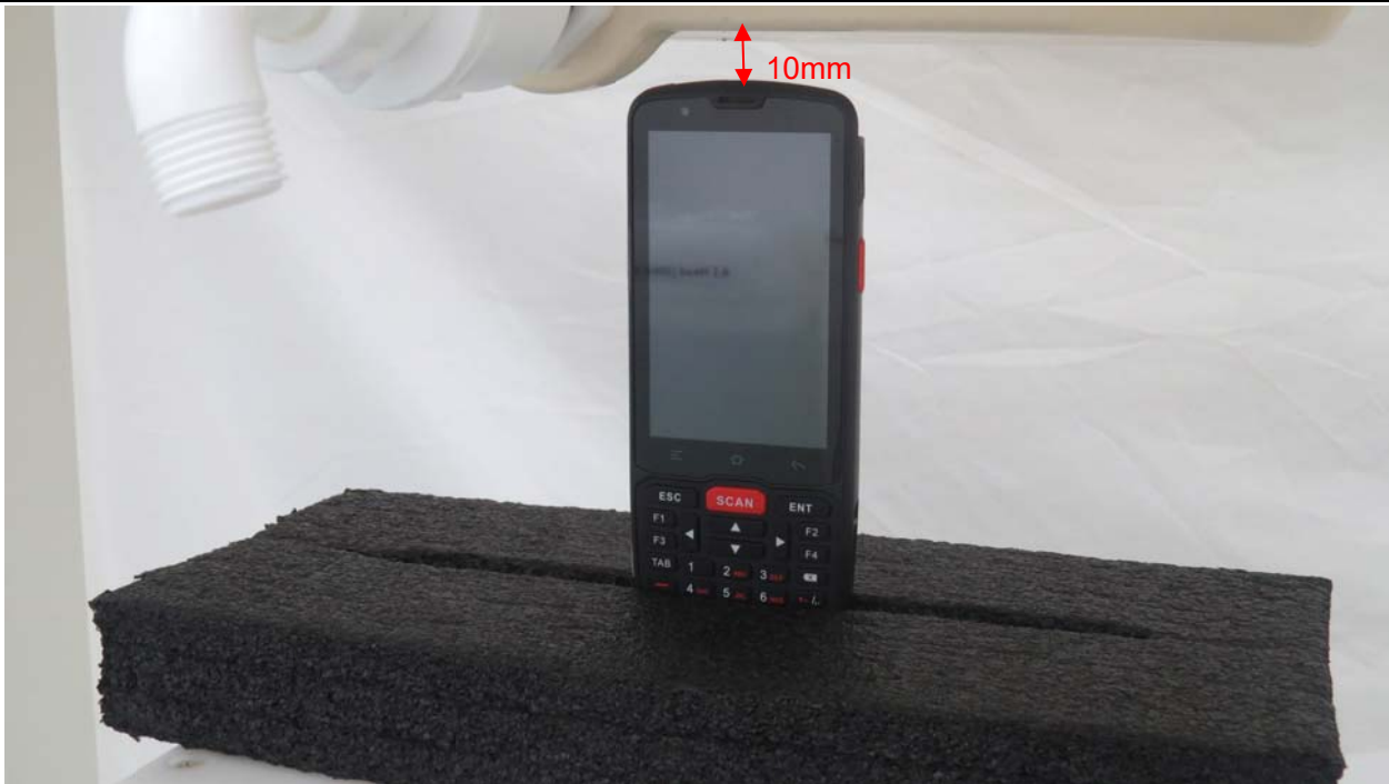
Picture 9: Top Edge, the distance from handset to the bottom of the Phantom is 10mm