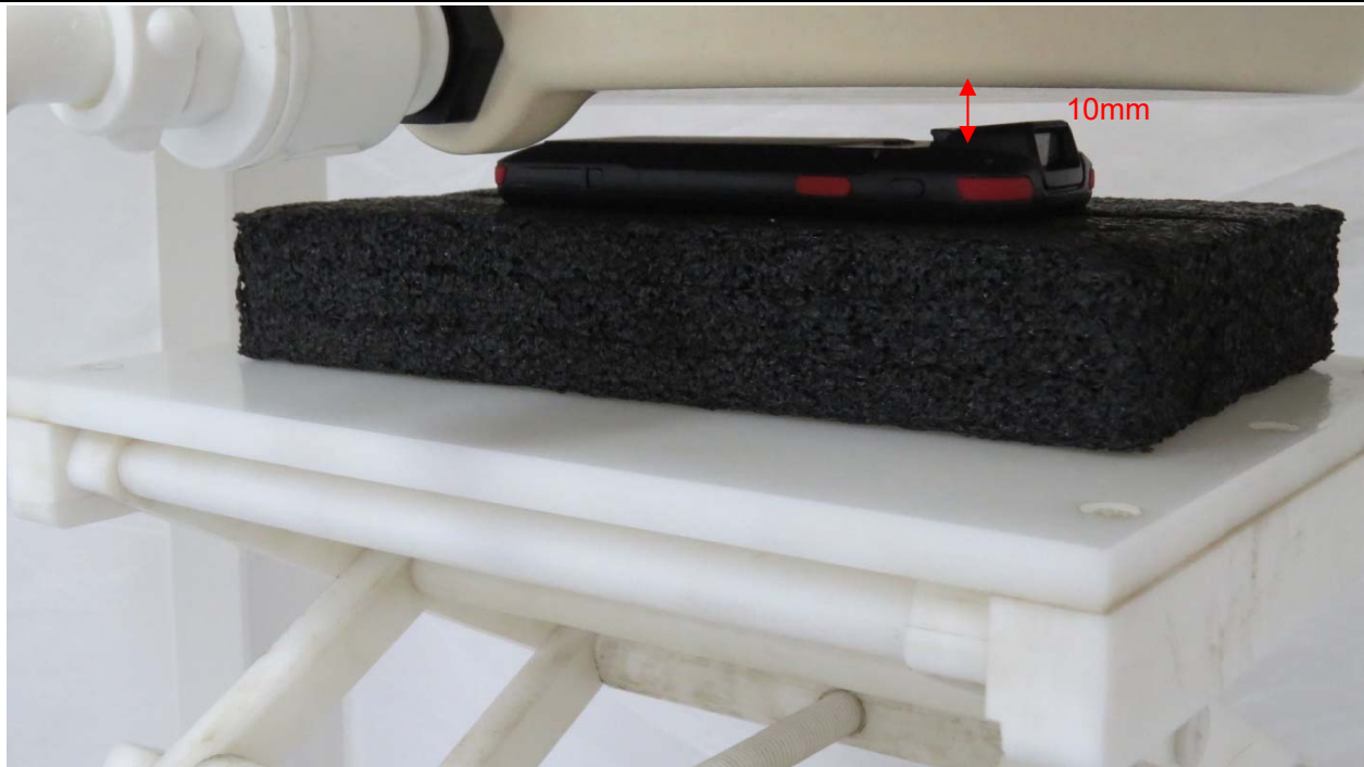
Picture 5: Back Side, the distance from handset to the bottom of the Phantom is 10mm