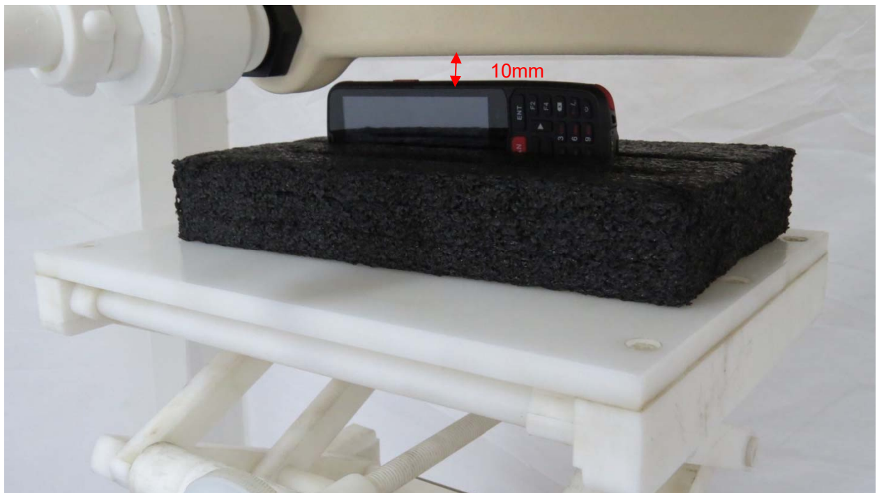
Picture 8: Right Edge, the distance from handset to the bottom of the Phantom is 10mm