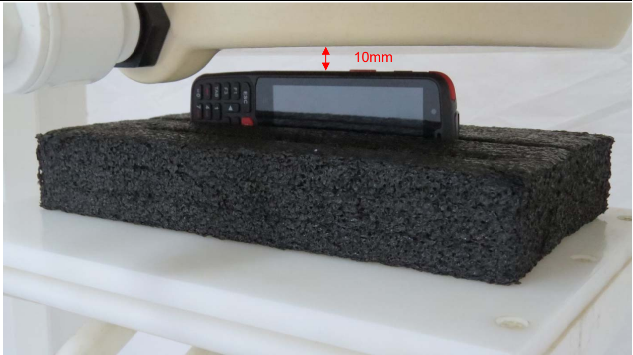
Picture 7: Left Edge, the distance from handset to the bottom of the Phantom is 10mm