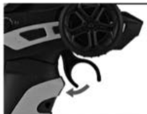
PUSH DOWN TO STEER THE CAR FORWARD