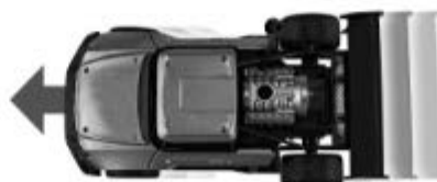
PUSH THE SWITCH DOWN AND THE CAR GOES FORWARD