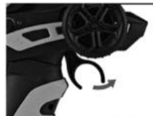
LIFT UP AND CONTROL THE CAR BACK