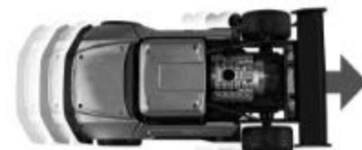
PUSH THE SWITCH UP AND THE CAR GOES BACKWARDS